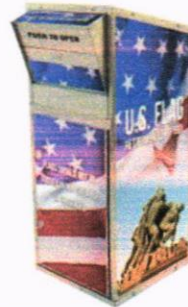
Iwo Jima Decal Set