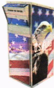
Eagle Decal Set