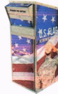
Saluting Soldier Decal Set