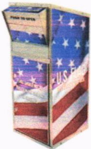
Flag Decal Set